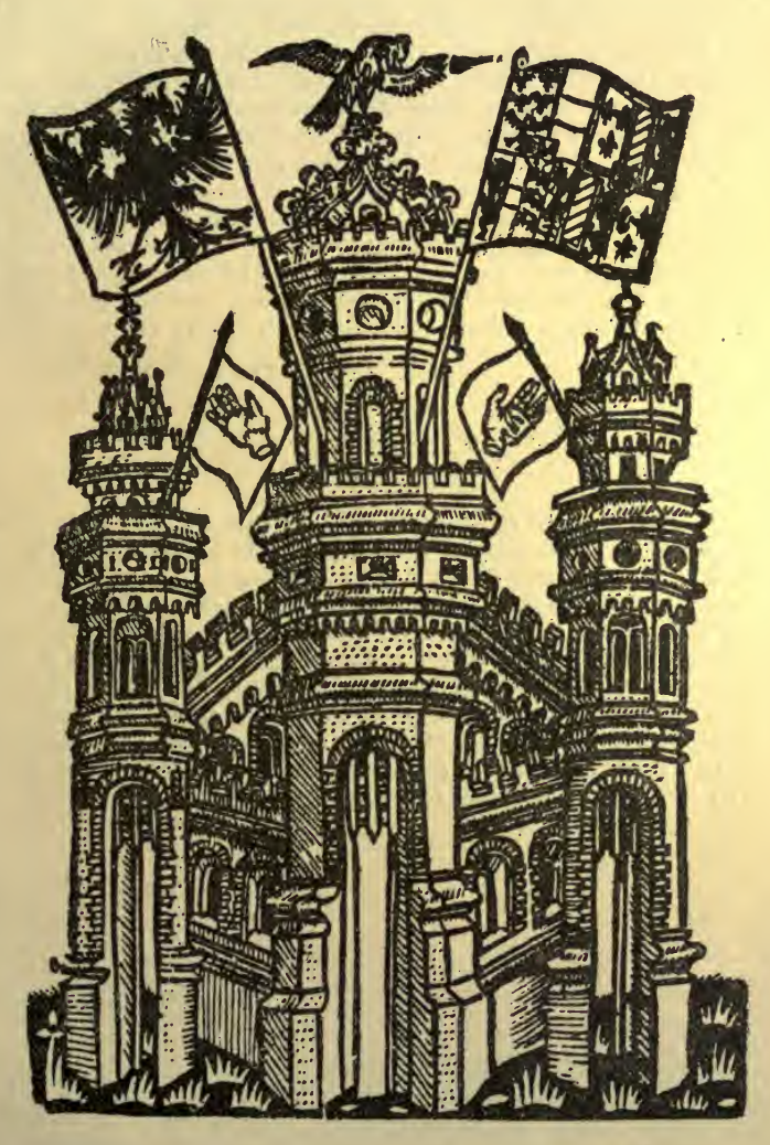
COLOPHON TO "THE CHRONICLES OF ENGLAND," PRINTED BY GERARD LEEW OF ANTWERP, 1493.